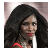
Bozoma Saint John